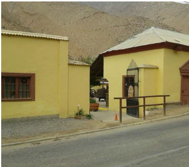
Frontis Pisco Los Nichos.

📍 Located on Calle Principal s/n in Montegrande